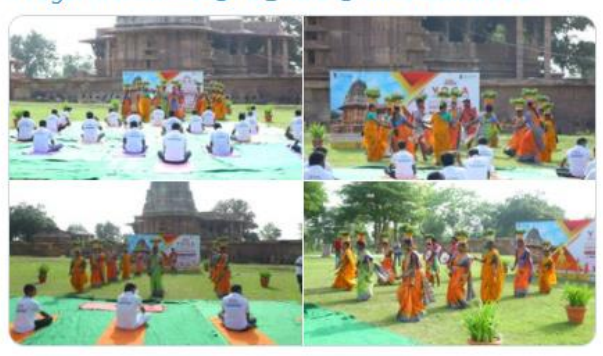
3:58 PM · Jun 21, 2021 · Twitter for Android

#InternationalDayOfYoga #YogaAnIndianHeritage #EkBharatShreshthaBharat #AzadiKaAmritMahotsav #YogaForWellness @PIB_India @MinOfCultureGol