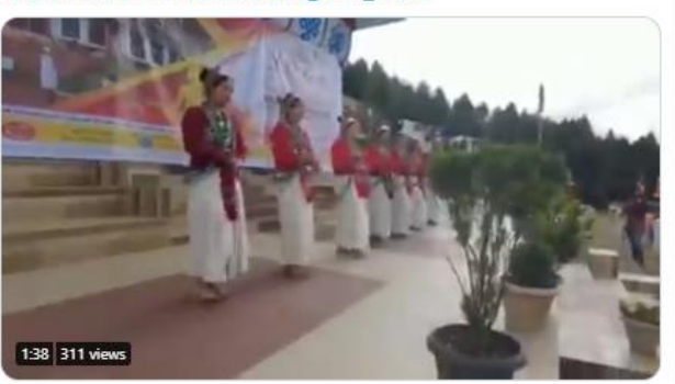
1:47 PM · Jun 28, 2021 · Twitter Web App

Girls of Miji Tribe of #ArunachalPradesh bring out beautiful diversity of India with performance of folk dance &Monpa Folk songs on #IDY2021 programme at Gaden Rabgye-ling Monastery #Bomdila organised by @MinOfCultureGoI #EkBharatShreshthaBharat #AzadiKaAmritMahotsav @PIB_India