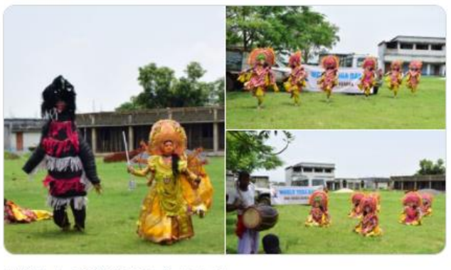
A-22 DM. Jun 20 2021 . Twitter for Android

Chhau dance performance at #IDY programme of @MinOfCultureGoI at Chandankiyari, Bokaro, Jharkhand. Chhau dance of eastern India has martial, tribal & folk traditions. It is included in prestigious Intangible Cultural Heritage list of UNESCO. #EkBharatShreshthaBharat @PIB_India