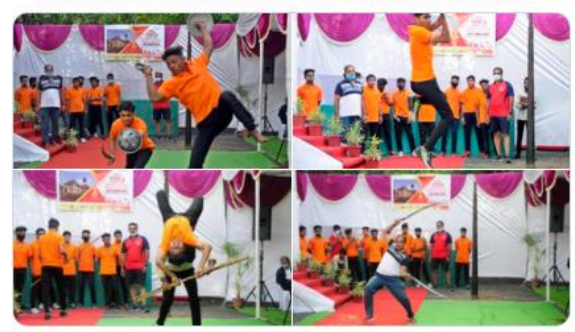
6:22 PM · Jun 24, 2021 · Twitter Web App

#EkBharatShreshthaBharat #AzadiKaAmritMahotsav