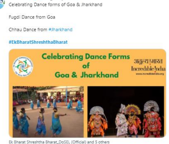
Ek Bharat Shreshtha Bharat_DoSEL (Official) and 5 others