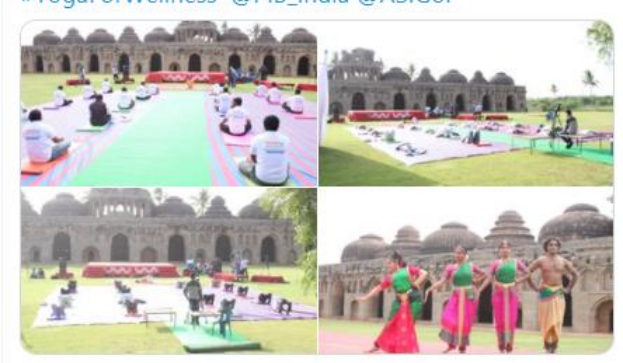
4:18 PM · Jun 21, 2021 · Twitter Web App

Yoga and cultural performances in backdrop of heritage monument at Hampi, Karnataka under nationwide Yoga programmes of @MinOfCultureGol #InternationalDayOfYoga #YogaAnIndianHeritage #EkBharatSreshthaBharat #AzadiKaAmritMahotsav #YogaForWellness @PIB India @ASIGol